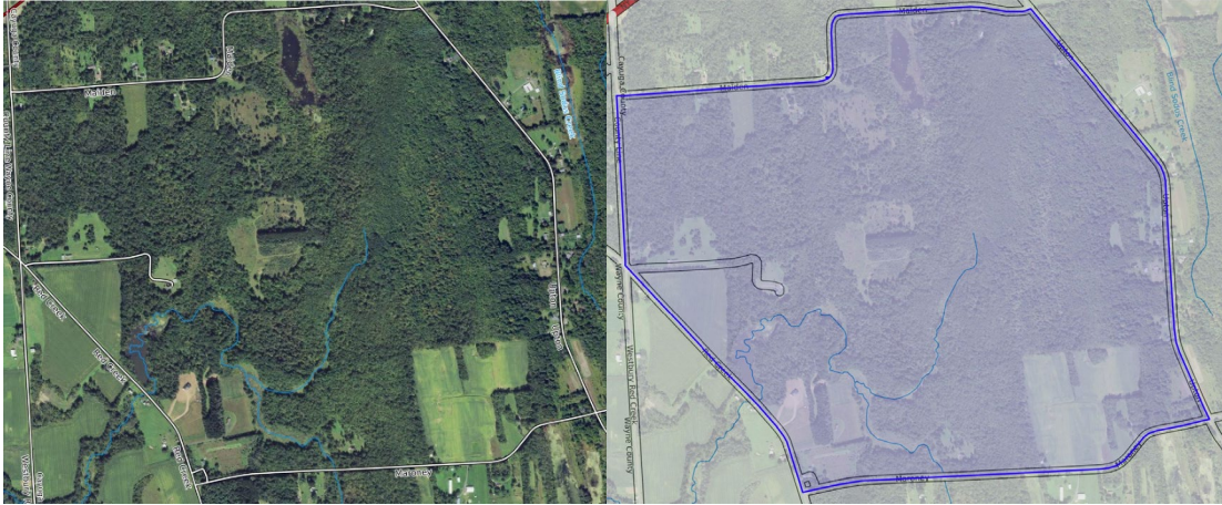
Figure 1. Left, a satellite image of the parcel of land. Right, location of the parcel of land. (Shaded region.) [1]